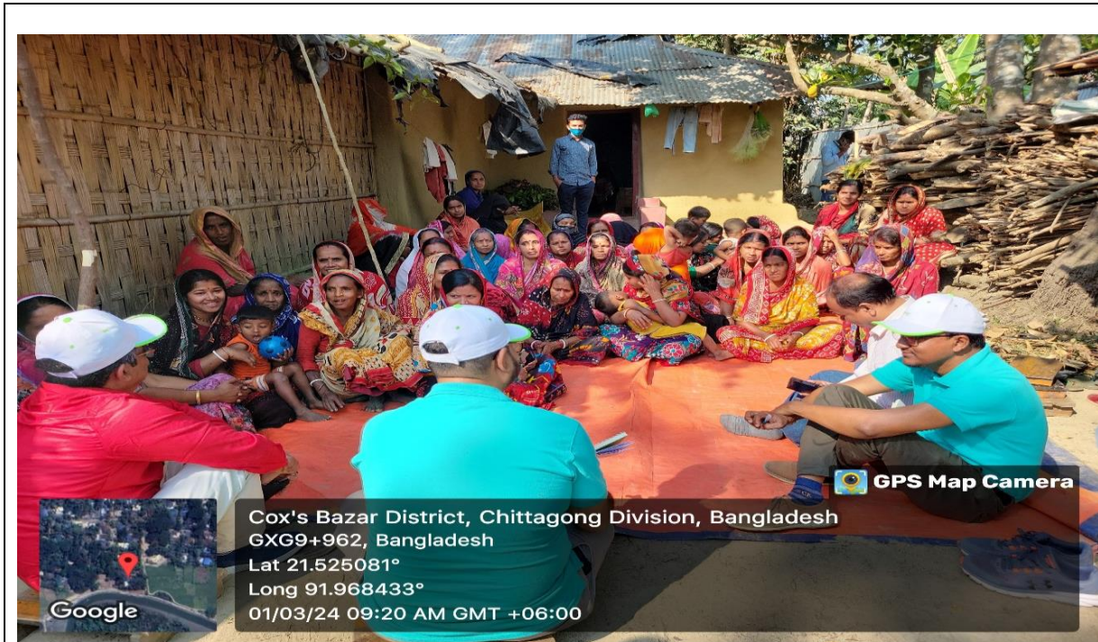
Fig: Community consultation with women group