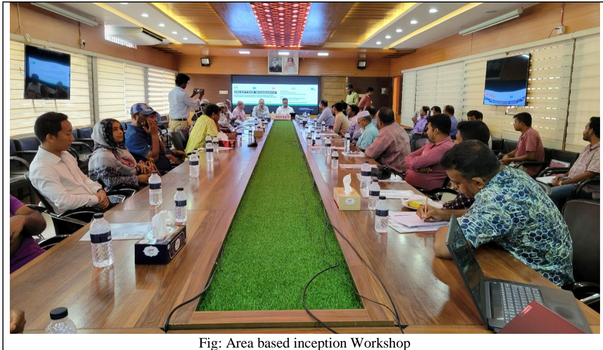
Fig: Area based inception Workshop