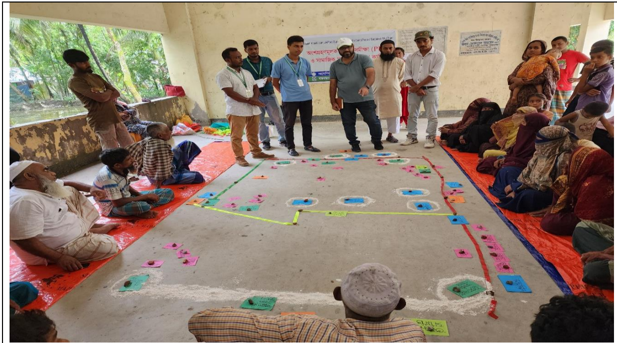
Fig: Participatory Rural appraisal