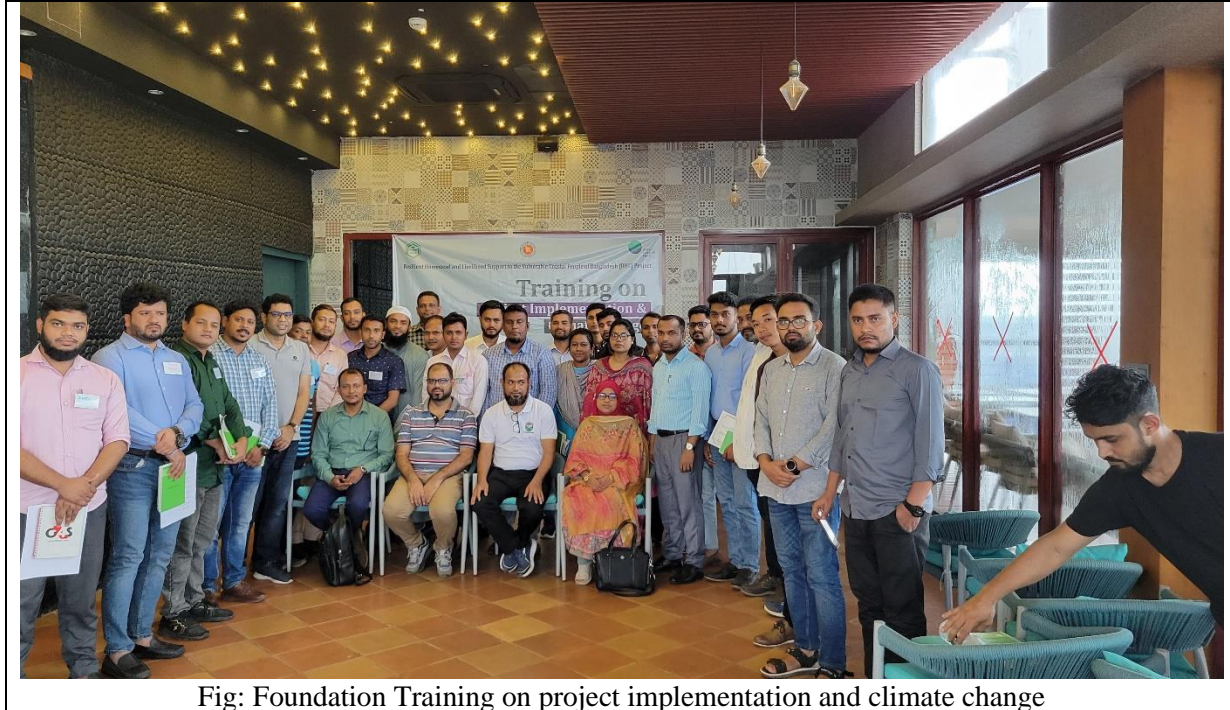
Fig: Foundation Training on project implementation and climate change